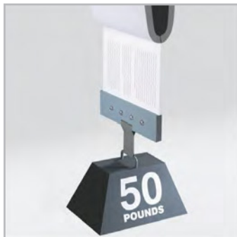
Super strong bind

The FB20 is the ideal binding machine for all corporations, financial institutions, copy shops, print environments, or education establishments that require professional-looking presentations, yearbooks or bound documents at a fraction of the time required to bind with alternative binding solutions such as coil, comb, or wire. This machine offers unprecedented ease of use with its LCD display that guides the user through each operation using animated illustrations. The Fastback 20 works with all of the Powis binding materials, from the versatile Super Strip to the customised Image Strip to the Perfectback strips for perfect binding books. It can create anything from a simple report to a 350-sheet hard cover book.