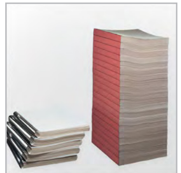
3.5 times faster than punch-and-bind