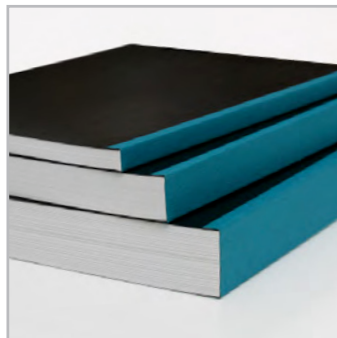
3 different strip widths for binding from 10-350 sheets