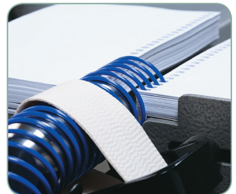
Front Support Table allows thicker books to be opened in half for easier insertion.