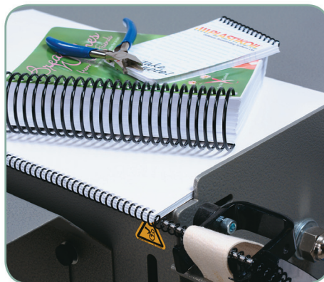
Full Range – From the smallest notepad to the largest calendar. Diameters 6-50 mm.