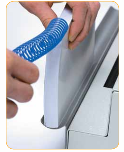
Front alignment channel curves the book to allow for easier coil insertion.