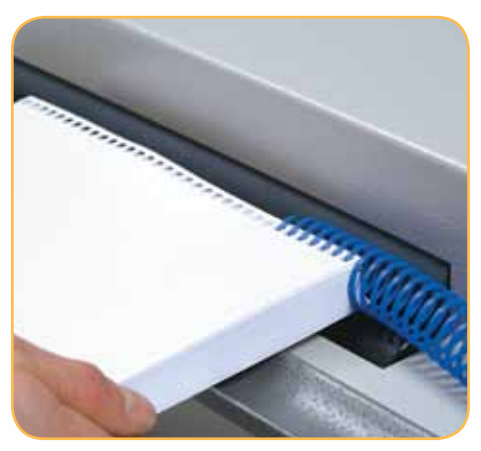
Rollers spin continuously allowing for free use of the operator's hands.

PDC Presentation Solutions Ltd T: +44 (0) 20 8810 5770 - E: sales@pdcuk.com www.pdcuk.com