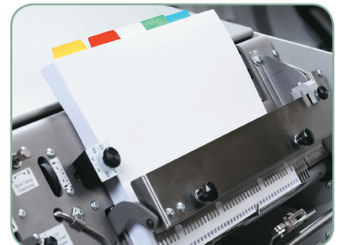
Vertical book placement has gravity working to it's advantage.