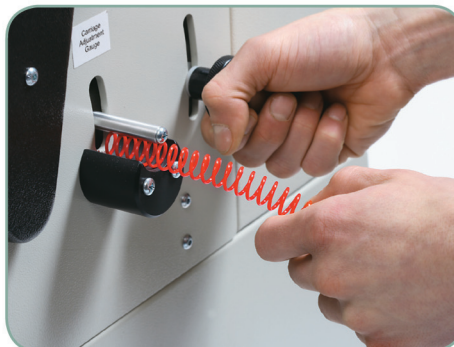
Innovative coil diameter adjustment provides for proper carriage positioning