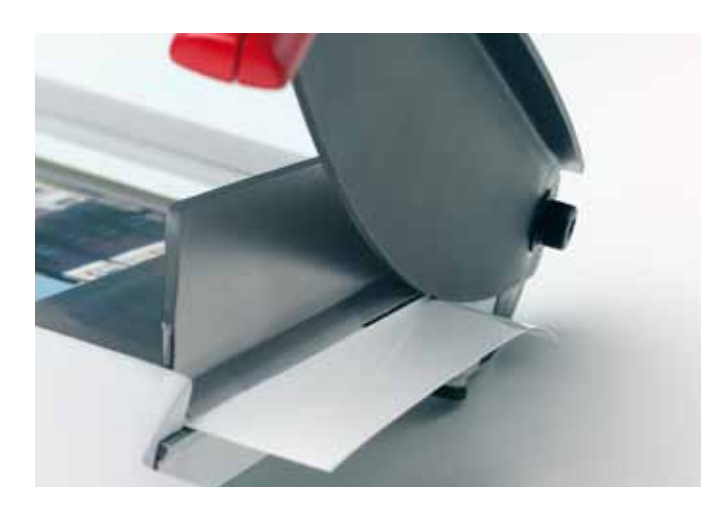
CUTTING LINE INDICATION The cutting line indicator, which is integrated into the clamp bar, allows precise aligning of the paper to be cut.

Perfect Document Creation Unit 14a, Fleetway West Business Park Wadsworth Road Perivale, Middlesex UB6 7LD