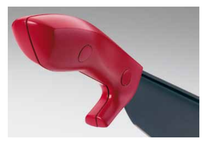
ERGONOMIC HANDLE The ergonomically designed handle has been developed for ease of operation and safe cutting.