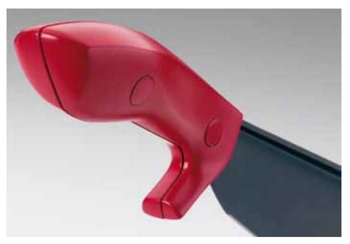
ERGONOMIC HANDLE The ergonomically designed handle has been developed for ease of operation and safe cutting.