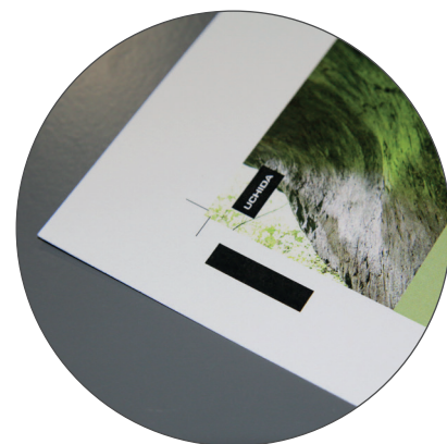
The AeroCut Nano lead edge sensor will detect the position of the printed image on each individual sheet.