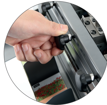
Cutters can be manually adjusted for specific jobs sizes.

Stable feeding mechanism: The AeroCut nano is equipped with stable upper-belt air suction feeding mechanism which can take wide range of paper stocks and sheet sizes from 210(W)x210(L) to 330(W)x488(L) mm along with paper weights from 120 to 350gsm. The feed table automatically elevates to separate the printed sheets to alleviate mis-feeding, along with any damage or roller-marks occurring on the finished products. The Nano also has a double-feed detection sensor to avoid wasting valuable prints. In addition, it's cut-mark sensor reads any image drift and will register to ensure a consistent finish on every sheet. There is also an adjustment to allow for printed sheets that are skewed.