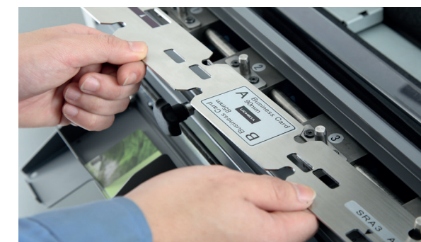
The patented InstaSet bar makes job change extremely easy and quick