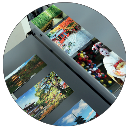
The durable guillotine cuts stocks up to 400gsm* in weight