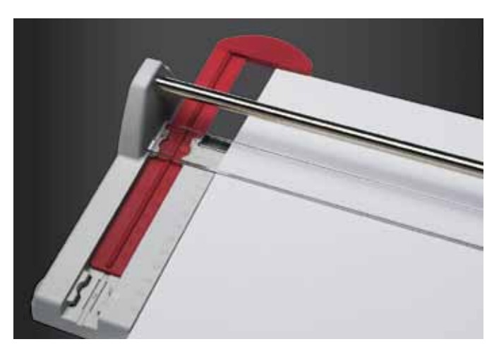
FRONT OR BACKGAUGE This extendable bracket with mm-scale can be used as either a front or a backgauge.