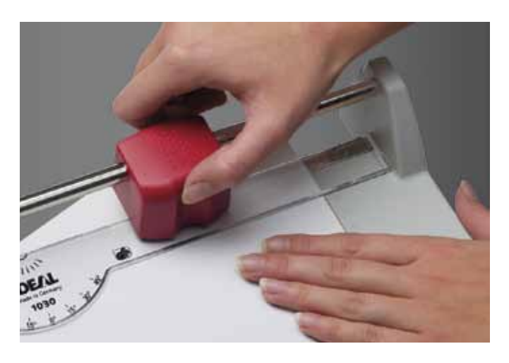
SAFETY CUTTING HEAD For safe and precise cutting: Ergonomically designed safety cutting head with rotary knife made of hardened steel.