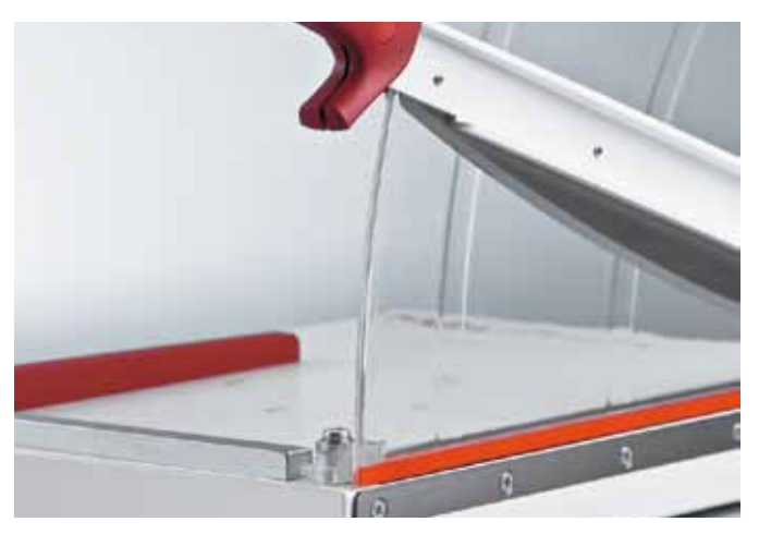
CUTTING LINE INDICATION The cutting line indicator, which is integrated into the clamp bar, allows precise aligning of the paper to be cut.