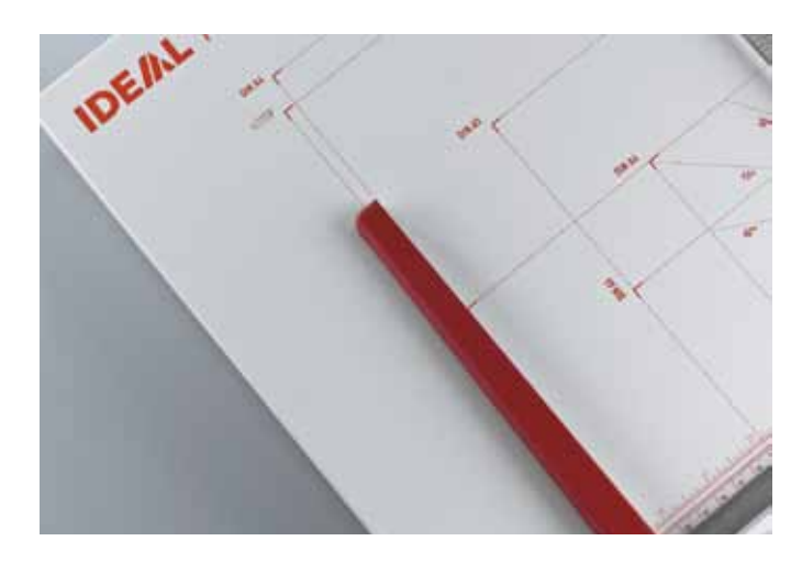
FORMAT AND ANGLE INDICATIONS Standard paper sizes from A6 to A4, American "letter size" and various angle indications printed on the table.

Perfect Document Creation Unit 14a, Fleetway West Business Park Wadsworth Road Perivale, Middlesex UB6 7LD