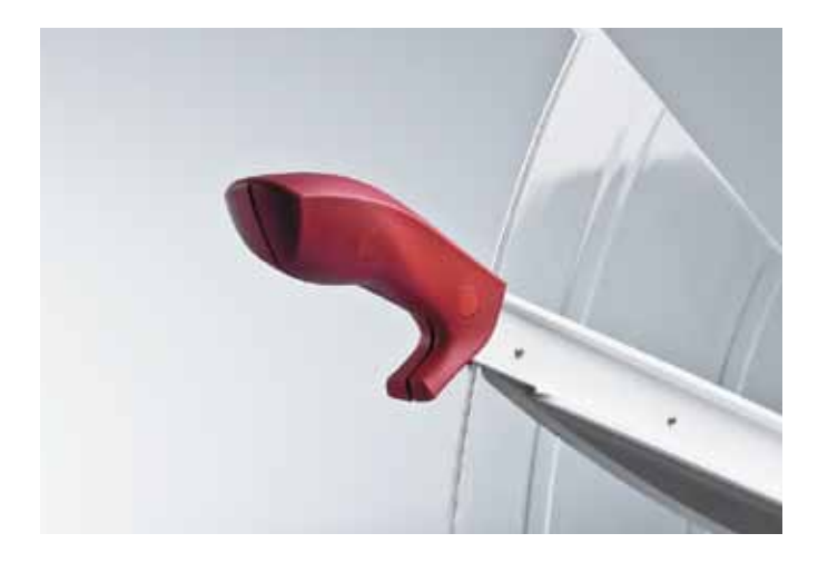
ERGONOMIC HANDLE The ergonomically designed handle has been developed for ease of operation and safe cutting.