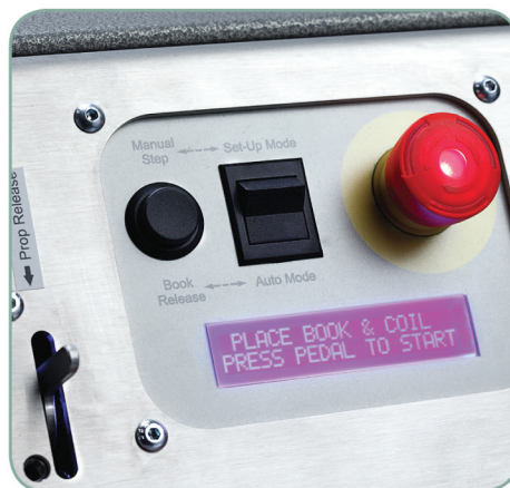
LCD Screen communicates machine status at all times.