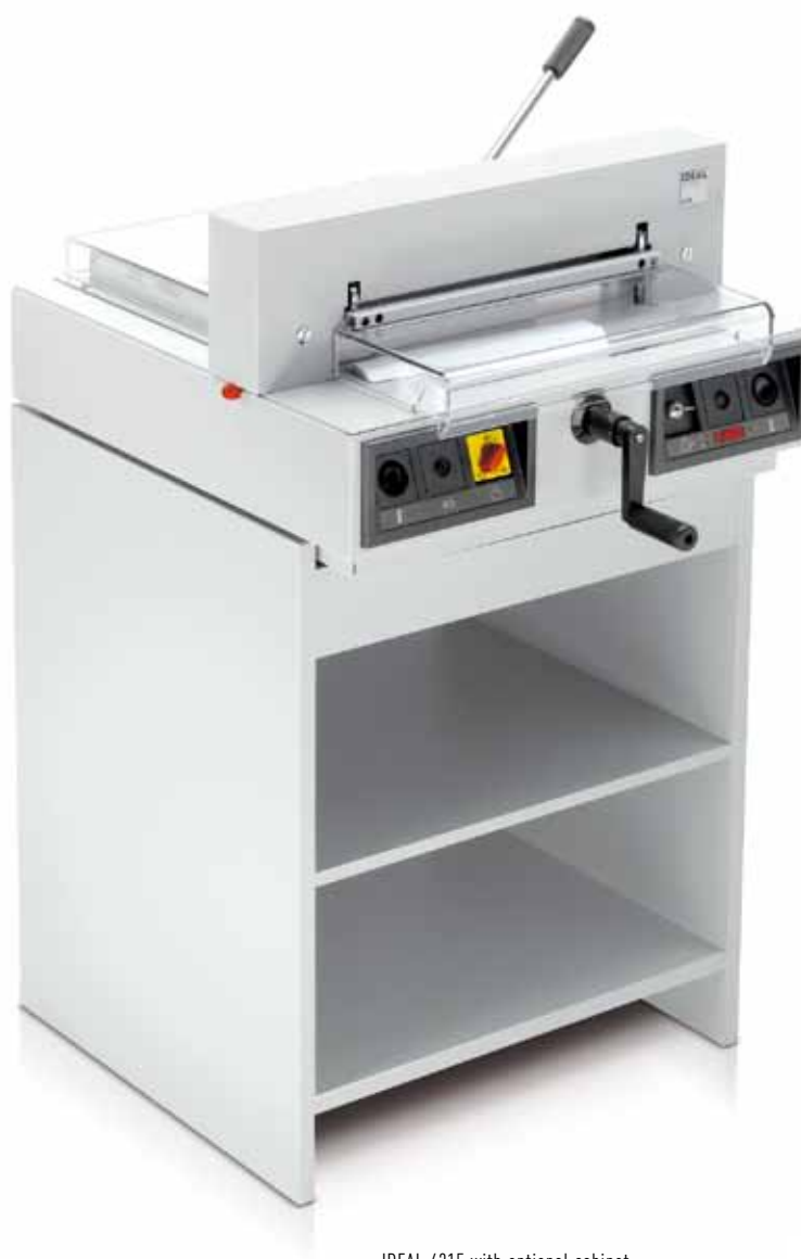
IDEAL 4315 with optional cabinet