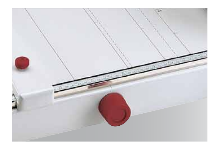
CALIBRATED ROTARY KNOB The front gauge can be positioned precisely to the desired dimension via the calibrated rotary knob.