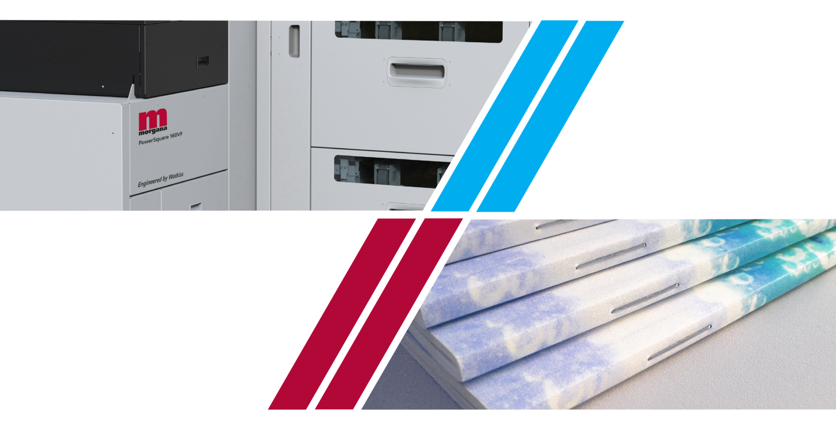
PowerSquare<sup>™</sup> 160 I 160VF