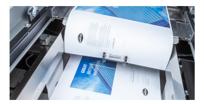
Collating station with the "tumbler" folding a sheet over to the station

Unique paper transport system with constant position monitoring ensures accurate and consistent paper handling, This ensures optimal sheet management and fold quality even with long sheets.