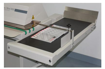
Optional 500mm wide conveyor with a capacity of up to 100 books bound in 1/4 "