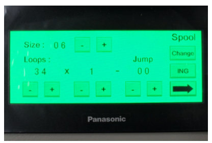
Touch screen interface