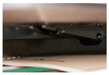
Wire-O® closing area with autocentering of bound document