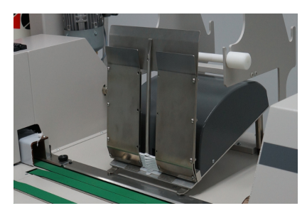
Optional automatic feeder for loose pre-formed hangers n°3 and n°7 with length from 76mm up to 250mm(up to 100 pieces)