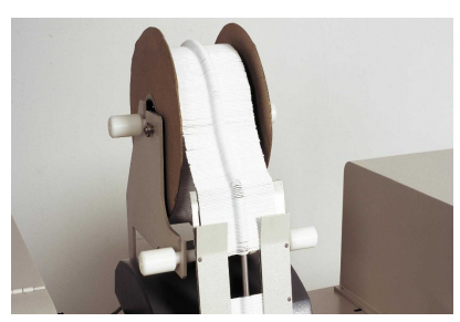
Optional hanger spool holder for reeled pre-formed hangers